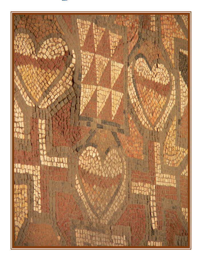
Building Life Together Reminding